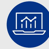
TPRM Capabilities and Maturing Assessment