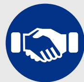
TPRM Program Support Services