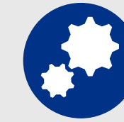
TPRM Program Implementation and Development