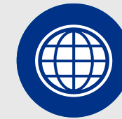
TPRM Ad-Hoc Review Services