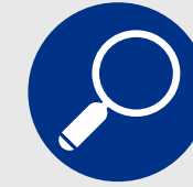
TPRM External Assessor Services